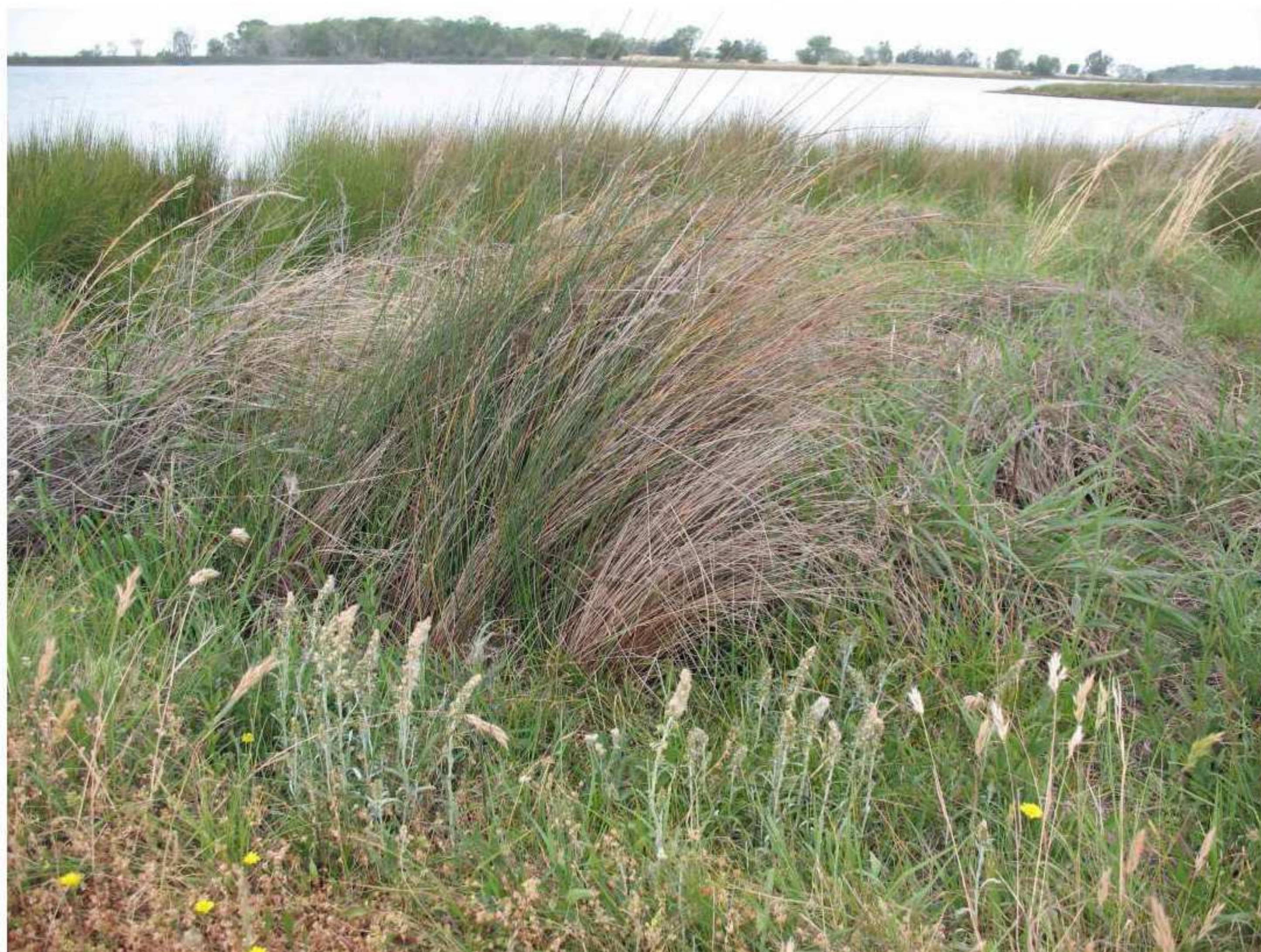
Figure 3. Gamochaeta argyrinea at Thermalito Afterbay site, 17 May 2012.

Centunculus minimus , Crucianella angustifolia , Eleocharis macrostachya , Galium tricornerutum , Gastrium phleoides , Gastrium ventricosum , Juncus acuminatus , Lathyrus angulatus , Plagiobothrys stipitatus , Plantago coronopus , Plantago virginica , Pseudognaphalium stramineum , Ranunculus pusillus , Rorippa curvisiliqua , Trifolium cernuum , Trifolium dubium , and Triodanis biflora . Records for these collections are from the Consortium of California Herbaria (2012).